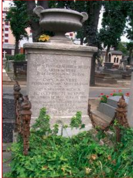
Cimetière des Batignolles Grave Marker 273292