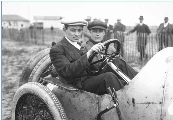
Cyril de Vère at the French Grand Prix at Dieppe, 1912.