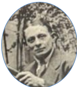
Detail from promotion postcard, Dieppe - 1912.