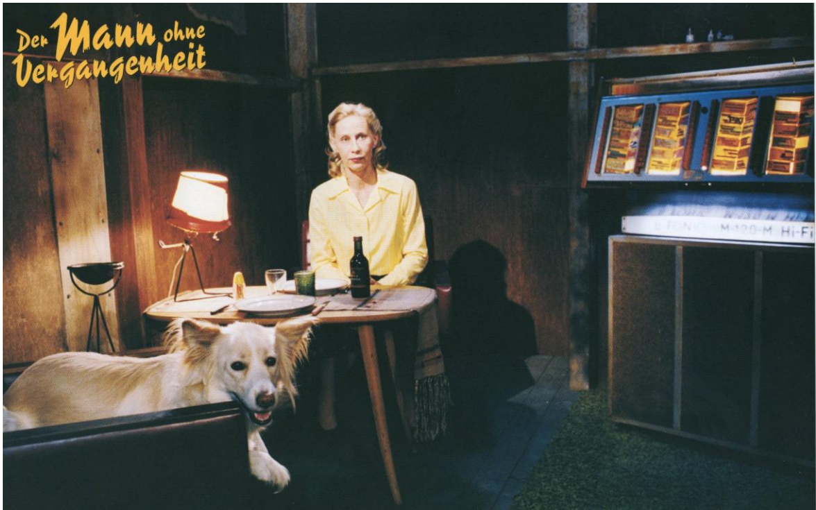
German lobby cards for the movie "The Man Without a Past" showing a model "Unitra-Fonica M-120-M". The movie was made by the Finnish director Aki Kaurismäki in 2002.