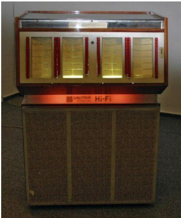
“Fonica M-123” made 1974 by Unitra Fonika in Łódź.