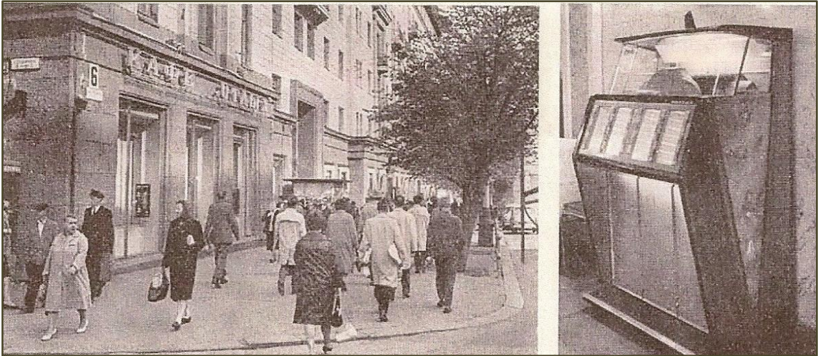
“Meloman M-120” on location in Café Otdykh, Tverskaya ulitsa (= Gor’kogo ulitsa), Moscow, in 1964. This was the first time the people in Moscow could ‘pay to play’, and hear popular hits (even a few from the West).