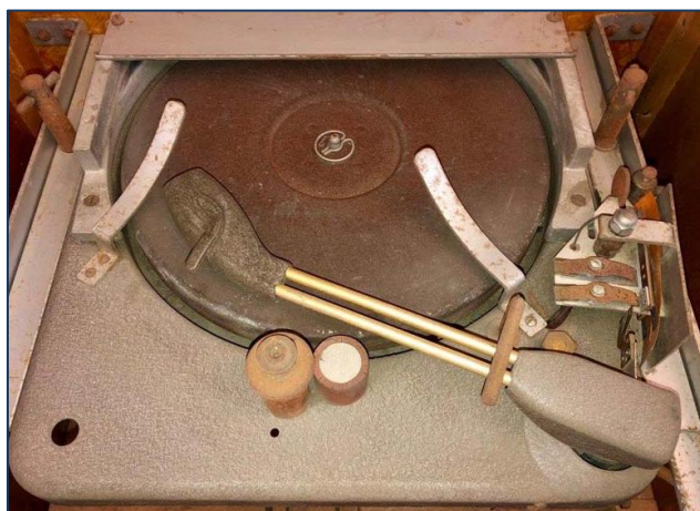
Turntable and serial number

French radio and gramophone collectors ought to be able to identify the turntable or the special double tonearm. It is not an American AuDaK tonearm, but British Garrard also made some double tonearms - late 1940s.