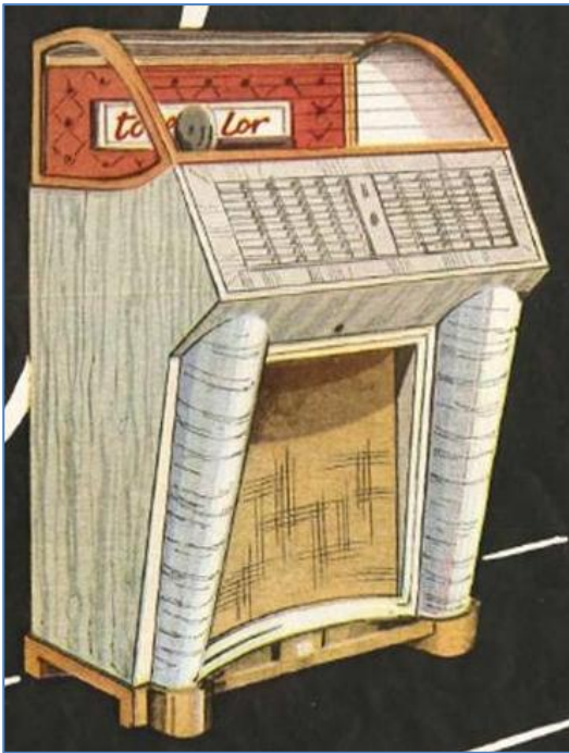
Tonecolor J-32, 100 sel, tape (1953-54)