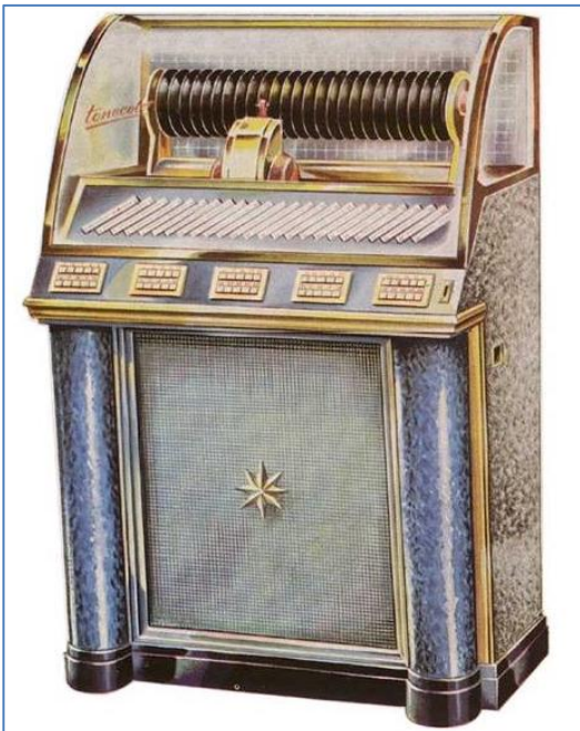
Tonecolor J-34, 50 sel, 45 rpm (1954-58)